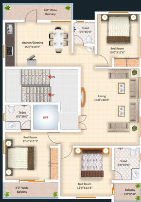
TYPICAL 1st to 7th FLOOR PLAN